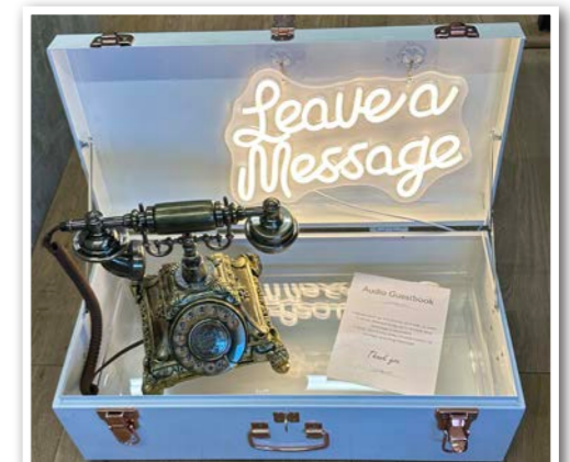
AUDIO GUESTBOOK - £95

Record a message to encourage your guests to leave you a congratulatory message when they pick up our vintage phone handset! We'll send them to you after your wedding to reminisce and keep forever.