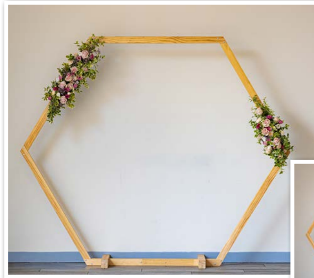
MOON GATE - £55

Floral additions not included, for illustrative purposes only.