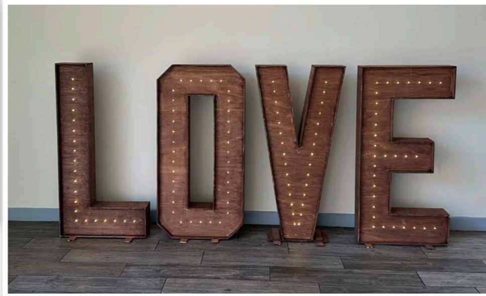
LIGHT UP LOVE LETTERS - £125