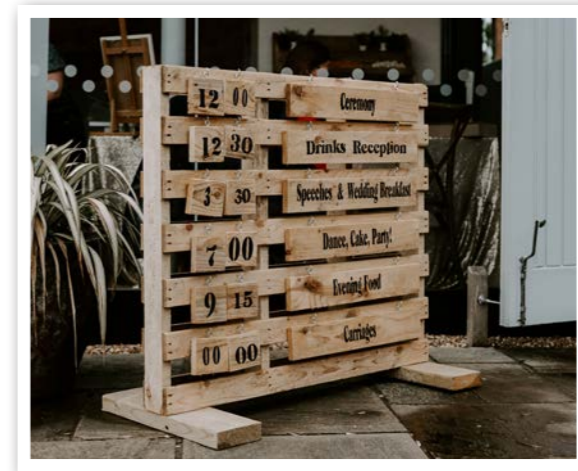
ORDER OF THE DAY PALLETTE - £95

Includes wood and staff member to light, manage and maintain for 2-3 hours of burn time. Will be refunded in the event of wet weather.