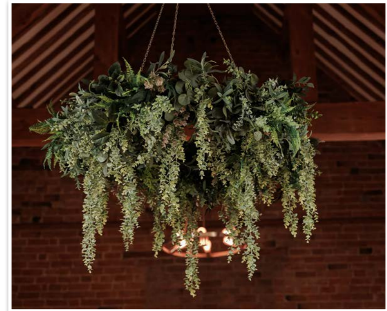
FLORAL CHANDELIERS - £150 / PAIR

Greenery included, floral additions not included, for illustrative purposes only.