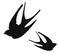
POST BOX - £30