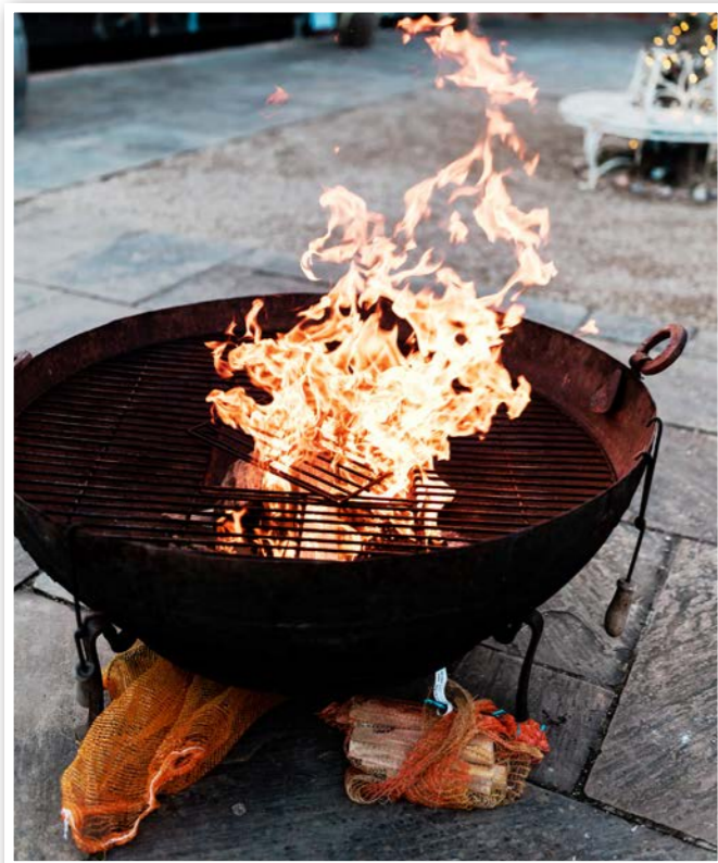
FIRE PIT - £195

Add an interactive element to your drinks reception! Does not include drinks but bottles can be added or used towards your drinks package allowance.